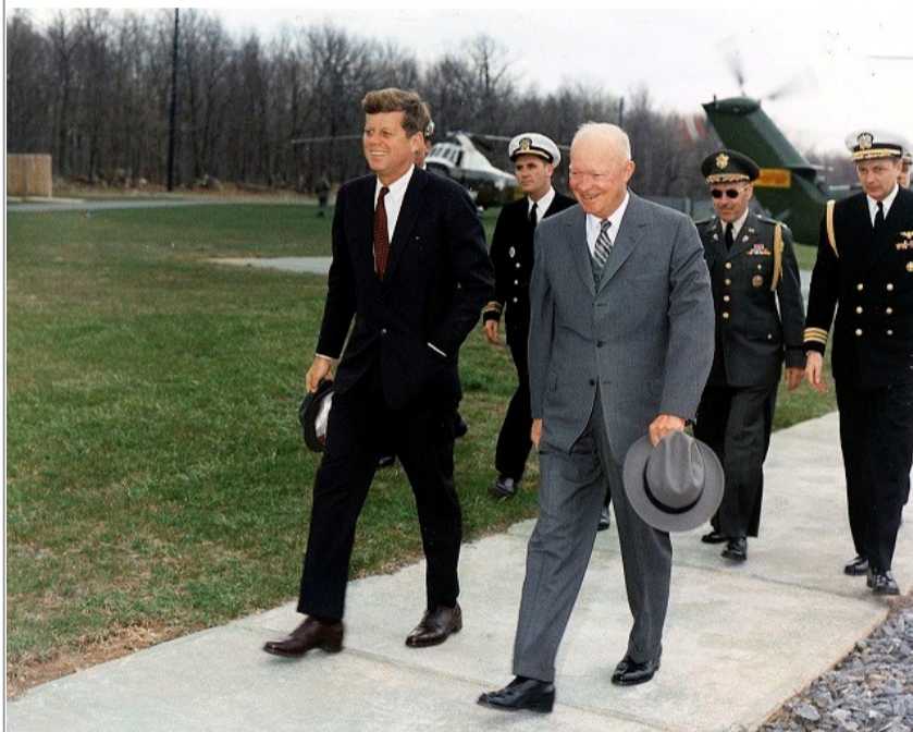
President Kennedy meets with former President Eisenhower Camp David, April 22, 1961 Office of the Naval Aide to the President

Current/Central Intelligence Bulletin Collection