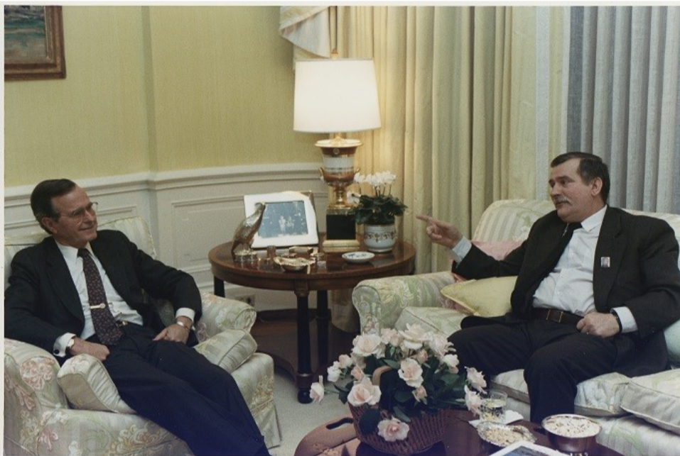
President Bush meets privately with Solidarity leader Lech Wałęsa of Poland in the residence 14 November 1989